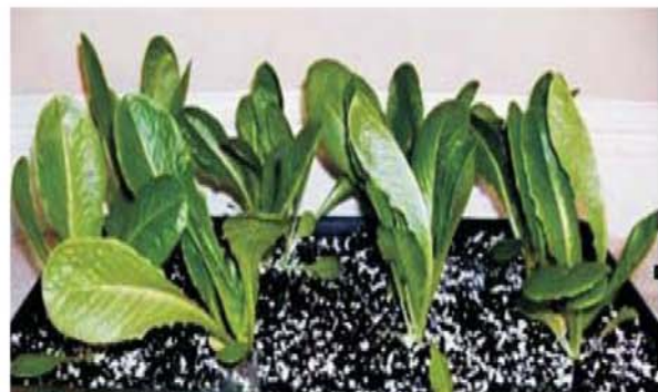
LED Lamp 15 Days