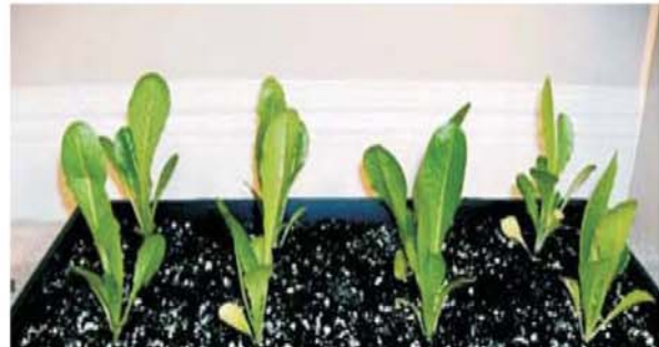
LED Lamp 9 Days