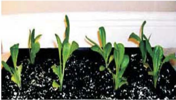
HPS Lamp 6 Days