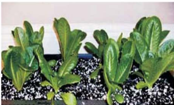
HPS Lamp 15 Days