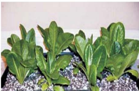
HPS Lamp 18 Days