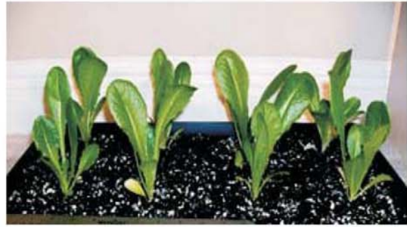
LED Lamp 6 Days