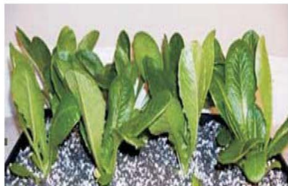
LED Lamp 18 Days