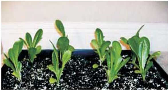
HPS Lamp 9 Days